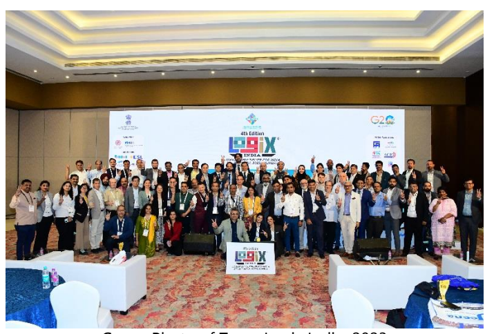
Group Photo with the Overseas Delegates